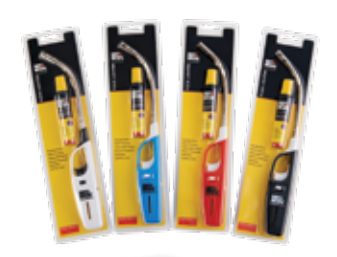
FLEXIBLE LIGHTER HDFL