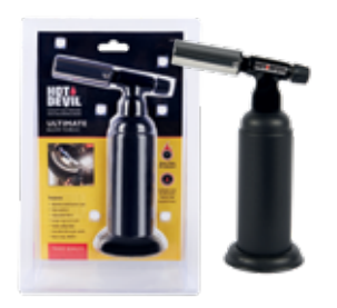
ULTIMATE BLOW TORCH HDUT