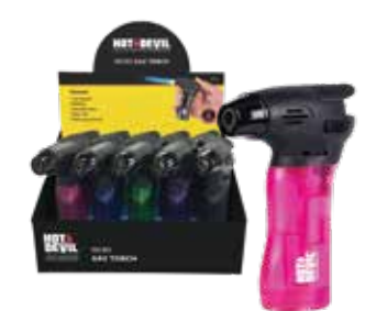
MICRO GAS TORCH COUNTER DISPLAY H08B/H08CD