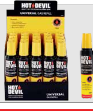
UNIVERSAL GAS REFILL 18ML COUNTER DISPLAY HDMG