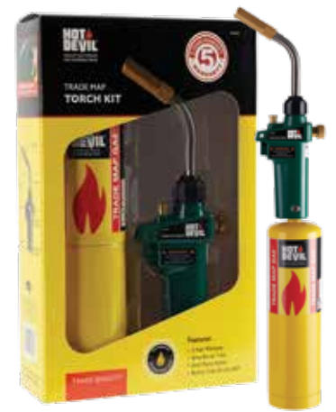
TRADE MAP TORCH KIT HD030