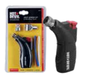
HEAT SHRINK KIT & BLOW TORCH HD911

* Not recommended to run the lighter for more than 2 minutes at a time.