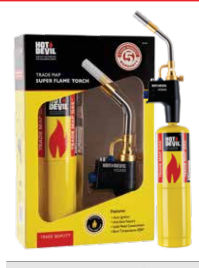
TRADE MAP SUPER FLAME TORCH KIT HD600